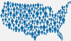
Deeper Geographic Reach

Deepens and strengthens client relationships