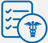
Enhanced Service Offering

Billions of Customer Touchpoints Annually